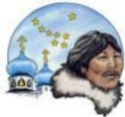
Kodiak Island Borough